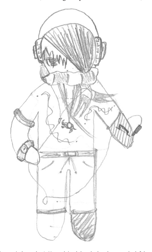
Fig. 2. Self-portrait drawn by A. He explained that the bandages on the left hand and foot indicated that he was "broken".

To resolve the resultant conflict between insecurity with his performance, fear of failure, and high expectations of himself, A. actively